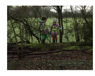
Mindfulness Welly walk and looking for signs of spring!