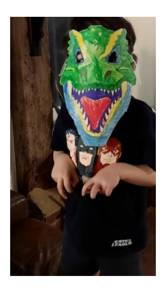
Junk model dinosaurs