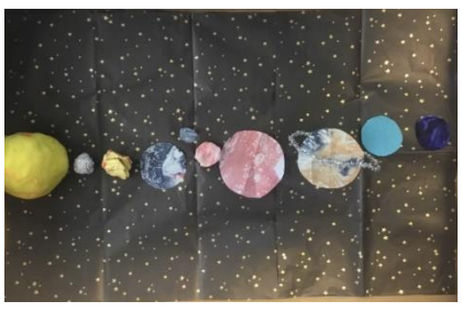
Dan's Planet work