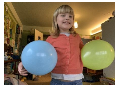
PE - balloon blasting