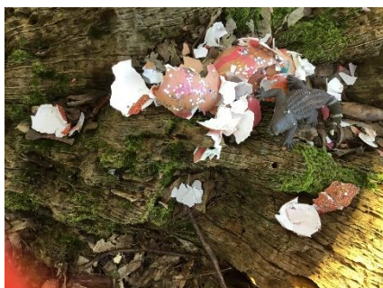
Reptiles hatching from eggs.