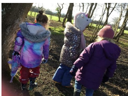
Going on a reptile hunt.